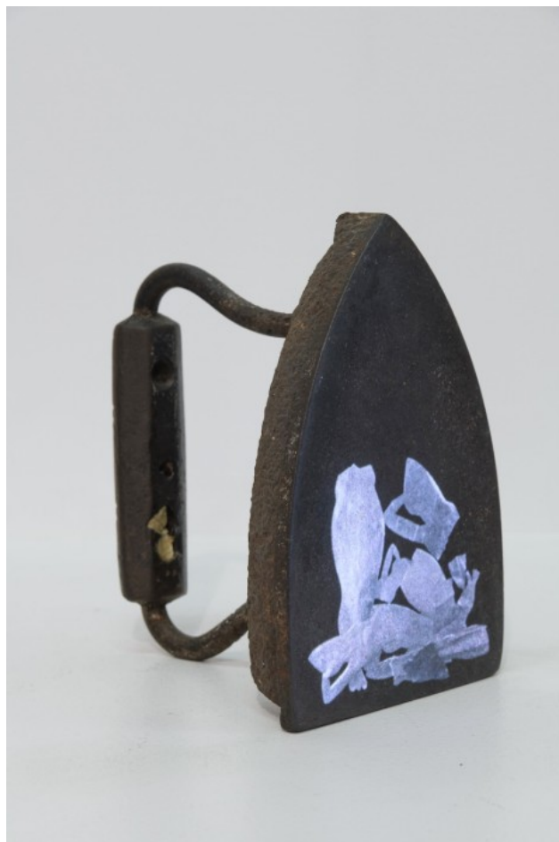
Stas Orlovski, "Monument (Iron)," 2021, stop-motion animation projected onto antique iron, 10 x 6 x 6"

In "Empire," Orlovski continues his poetic synthesis of history, myth, and memory, now with digital projection video loops enlivening his sculptures and oil painting joining drawing, printmaking and collage. Four of these video-enhanced sculptures take an iconoclastic look at "creed[s] outworn" (to quote Wordsworth), ideologies that have outlived their usefulness. "Monument" projects stop-motion images of falling pieces of classical statuary, and plasters of Vesuvius' victims at Pompeii, projected onto the hot plate of an antique iron — a direct tribute to Man Ray's 1921 "Cadeau (Gift)," an iron converted into an instrument of torture with the addition of a row of tacks or nails. "White Flag" pairs a found fiberglass casting of a white windblown flag, replete with ornate flagpole bedecked with acanthus leaves and a video of a fluttering flag, nicely satirizing with its separation of art and life our occasional unquestioned allegiance ... even to surrender.