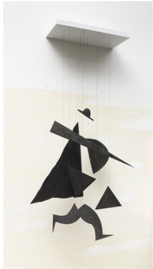
Stas Orlovski, “Running Man (Mobile),” 2022, bronze, wood and polycarbonate, 40 1/2 x 21 1/2 x 7 1/2”